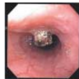
Bravo capsule attached to esophagus.

known as the Bravo pH test. With the Bravo pH test, a tiny transmitter, about the size of a vitamin, is endoscopically attached to the wall of the esophagus. The capsule sends pH level data to a pager-sized recording device worn by the patient who is able to continue his/her regular daily routine and consume a normal diet. After 2 or 3 days the transmitter capsule is naturally sloughed off and eliminated