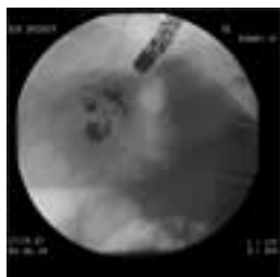
Biopolymer in EG junction.

An alternative endoscopic procedure, Enteryx, a Boston Scientific product, uses a liquid polymeric material that is injected into the muscle of