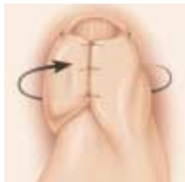
Stomach wrapped around fundus stitched in place.

a new esophageal valve by wrapping the upper portion of the stomach (fundus) around the lower end of the esophagus. The wrap is