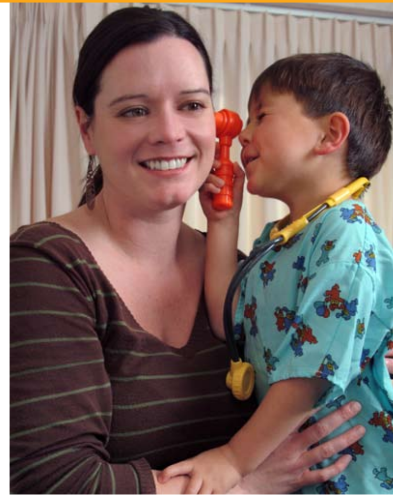
Child Life staff at the Pediatric Emergency Department use medical kits, puppets and other toys to prepare children for medical procedures.

Our Pediatric Unit and Pediatric Intensive Care Unit are located in the same building as the Pediatric Emergency Department, providing a seamless transition for children who need further care. In these units, our pediatric hospitalists work in partnership with a child’s pediatrician during a hospitalization. The hospitalists—who are available 24 hours a day—coordinate and oversee all inpatient care including subspecialty appointments, procedures, tests and transport.